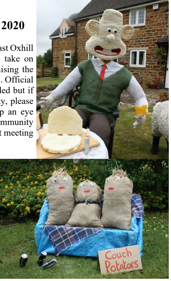
Scarecrows from our 2017 Scarecrow Festival

Lucy Mercer 07531 136136 lucymercer@hotmail.co.uk